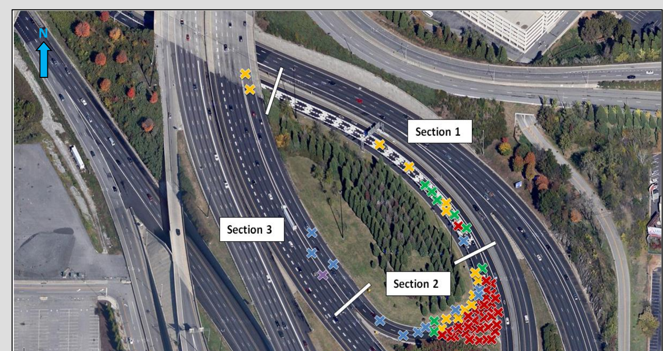
I-75 to I-85 Ramp Before

*Driver Familiarity is based on whether or not driver resides in 13-county Atlanta.